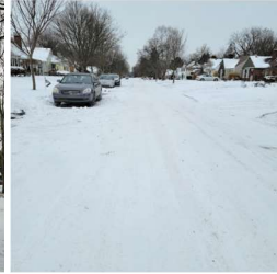
E Kanawha Ave