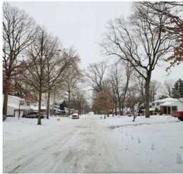
E Stanton Ave