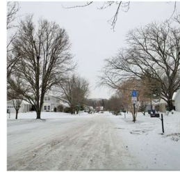
Indian Summer Dr