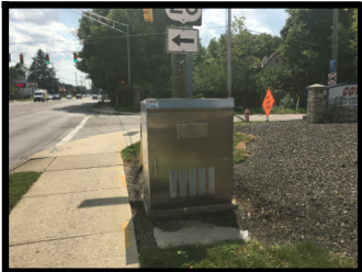
AT MORSE ROAD DIMENSIONS = 55"Hx44"Wx26"D