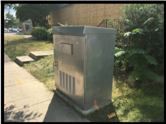
AT OAKLAND PARK AVENUE DIMENSIONS = 55"Hx44"Wx26"D