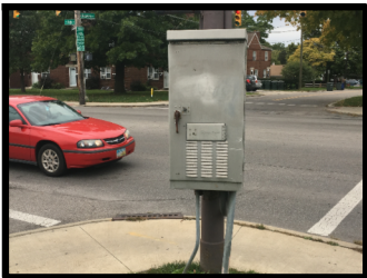
AT KANAWHA AVENUE DIMENSIONS = 50.5"Hx24"Wx16"D