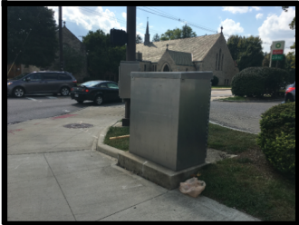
AT HENDERSON ROAD DIMENSIONS = 55"Hx44"Wx26"D