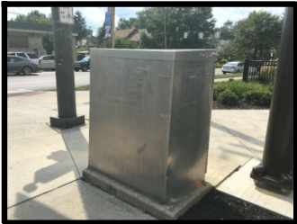
AT NORTH BROADWAY DIMENSIONS = 55"Hx44"Wx26"D