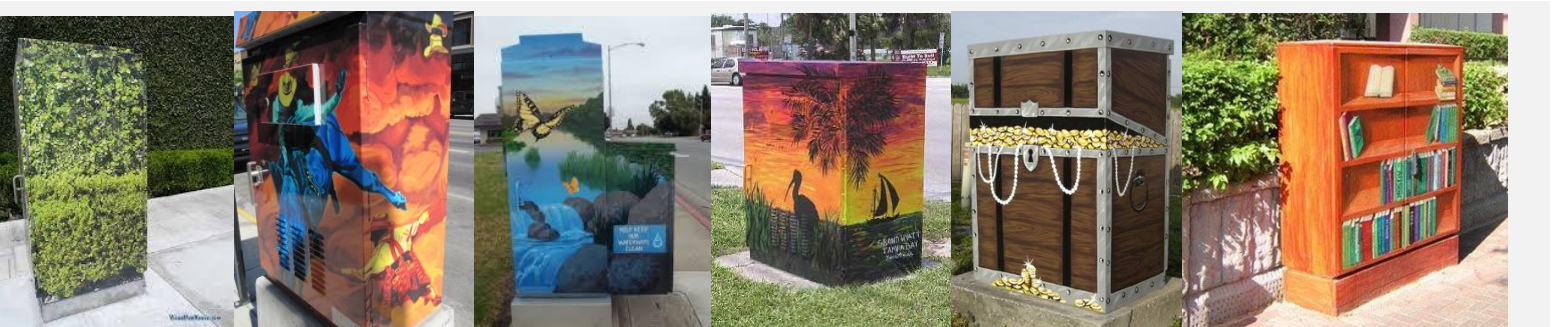
Examples from Boston, Tampa, Cleveland, Seattle, and Missoula

Installation Process: Printing of vinyl wraps and installation process will be coordinated by the Clintonville Area Commission Planning and Development Committee. Artists will be responsible for providing their designs in digital format, and answering any questions from the vinyl wrap manufacturer. They also may be asked to make slight modifications to their design based on cabinet vent, keyhole, and/or hinge locations that hinder the overall design. Installation is expected to begin in Fall 2019.