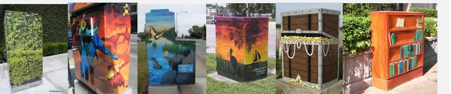
Examples from Boston, Tampa, Cleveland, Seattle, and Missoula