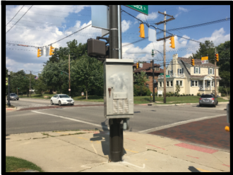
AT HOLLENBACK ROAD DIMENSIONS = 50.5"Hx24"Wx16"D