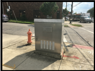
AT COMO AVENUE DIMENSIONS = 55"Hx44"Wx26"D