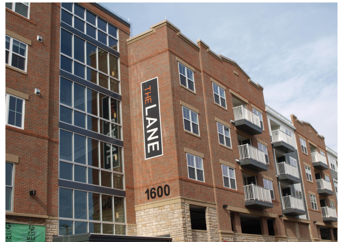
VIEW OF THE LANE