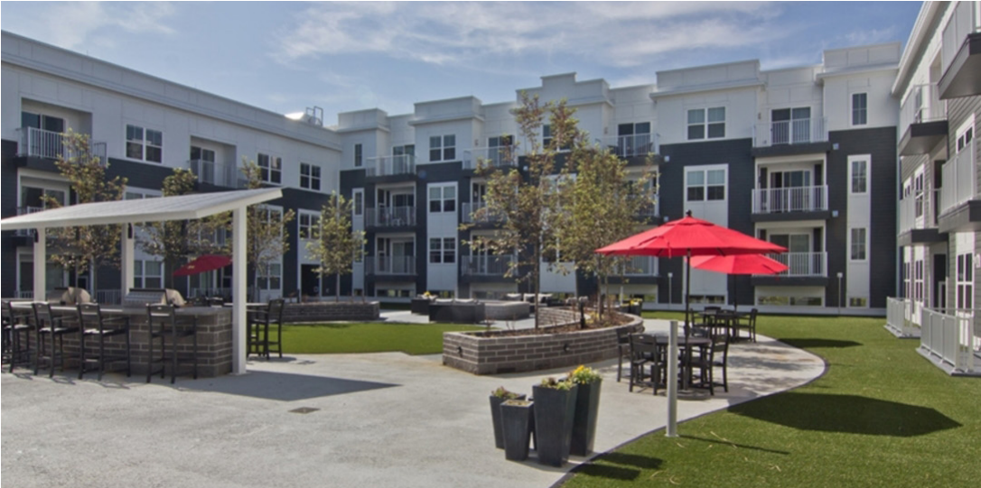
THE LANE, RESIDENTIAL COURTYARD