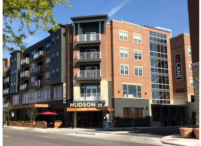
LANE AVE, SOUTHEAST CORNER OF THE LANE