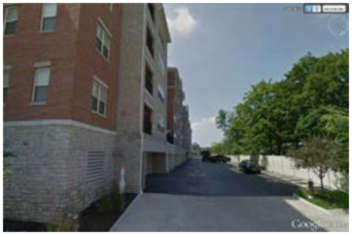
Arlington Crossing exterior parking