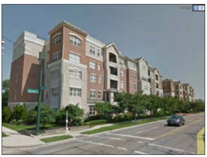
Arlington Crossing Streetview